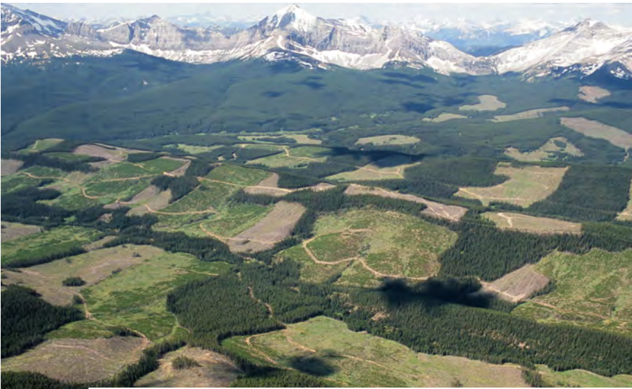
Cut-blocks, headwaters Oldman R. Basin, north of Crowsnest Pass, 2007